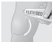
Apply the gel evenly around the joint.